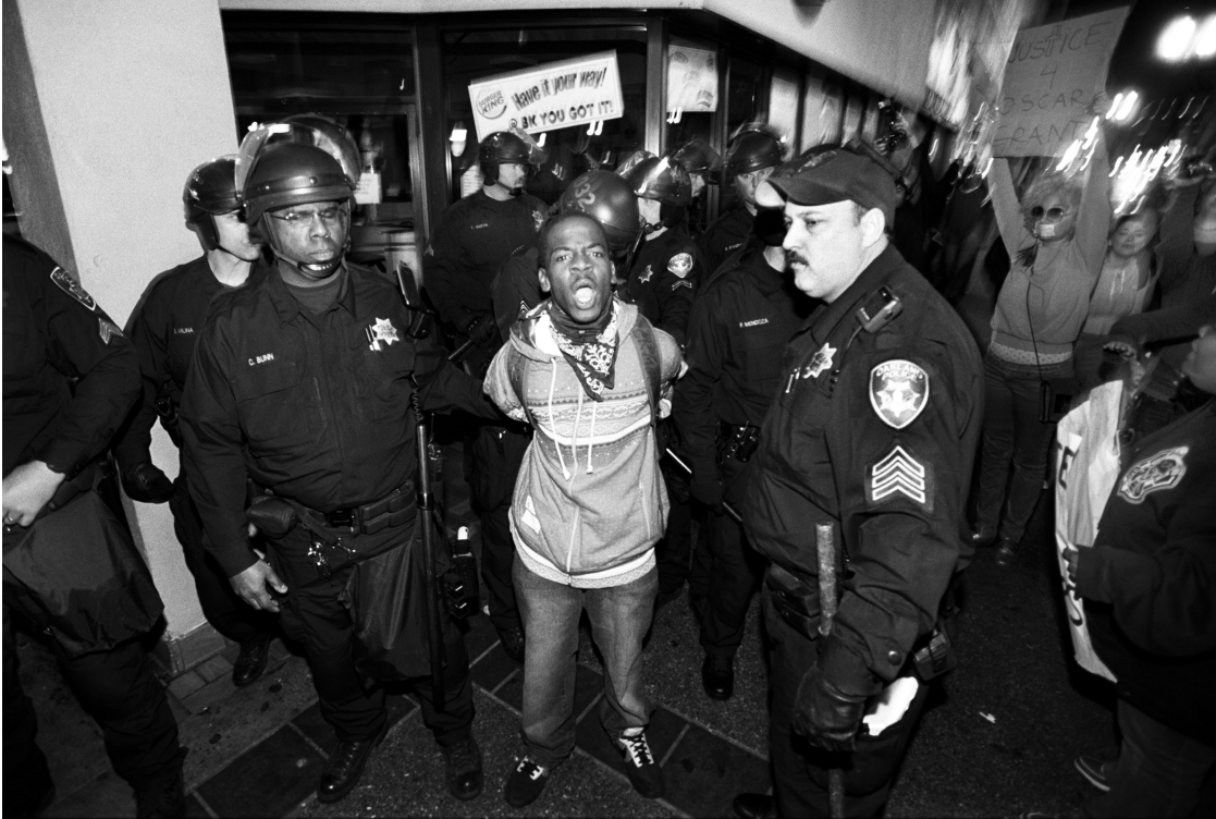
Oakland rebellions, January 14, 2009