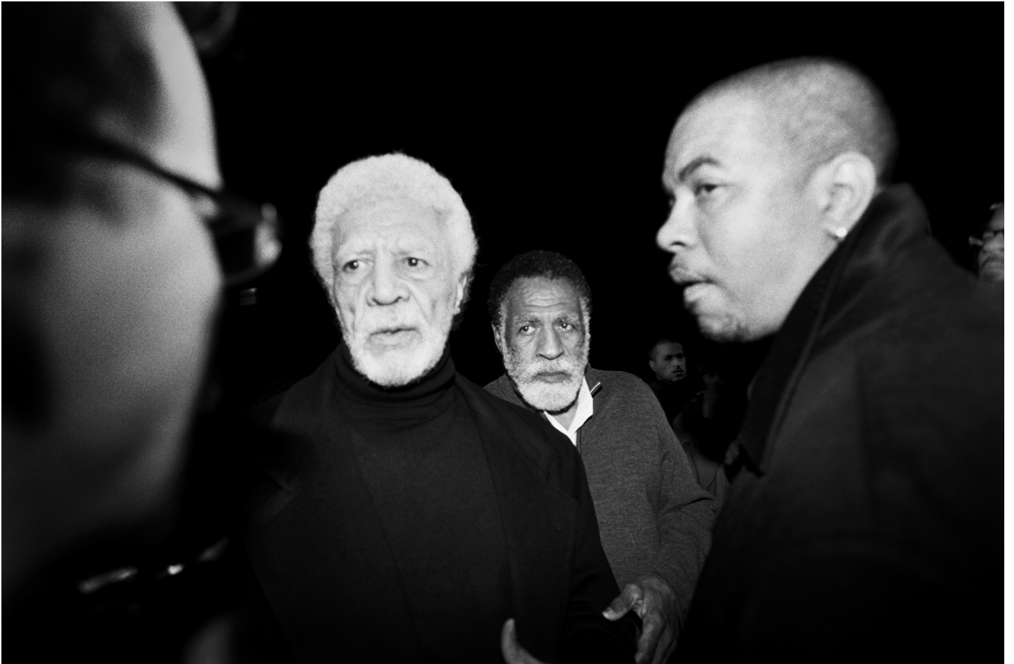
Oakland rebellions, January 7, 2009