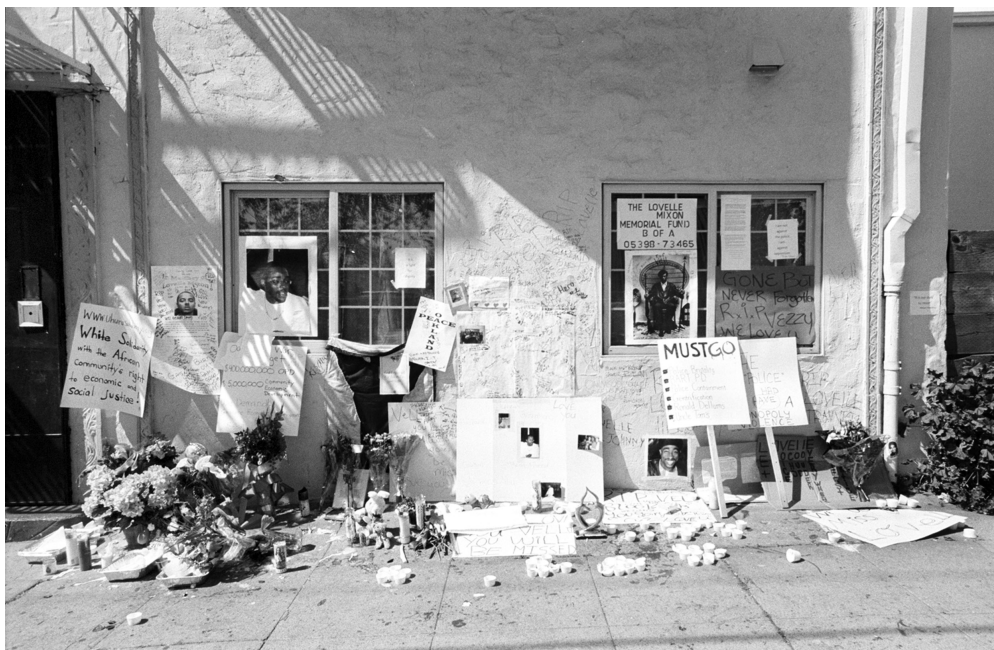
Memorial for Lovelle Nixon, March, 2009

Such are the status of “routine stops,” and in a country where racial profiling is all but accepted practice among police, we should be wary of any claim to “routine-ness.” The only thing “routine” about such stops is the harassment that the black and brown community suffer at the hands of the police every day.