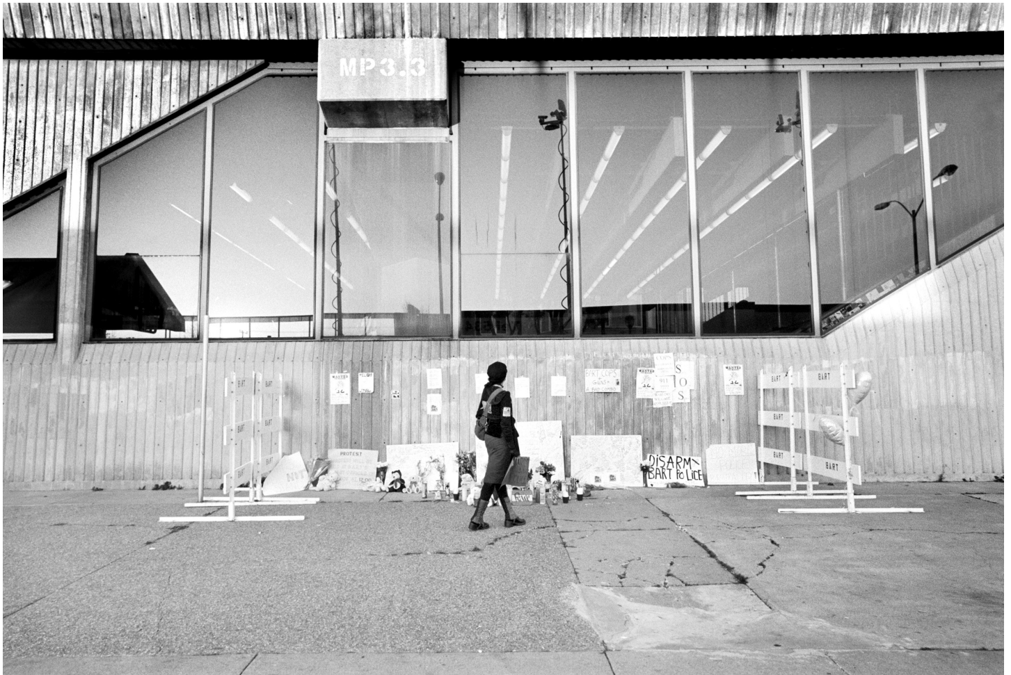
Fruitvale Bart, Oakland rebellions, January 7, 2009