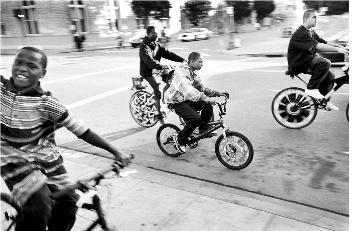
Oakland rebellions, January 7, 2009